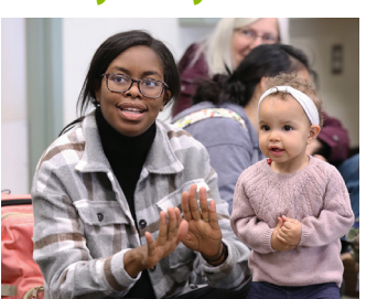
Fridays 11 a.m.-noon Stories, art activities, rhymes, singing and fingerplays for the whole family. Ages 0-6.