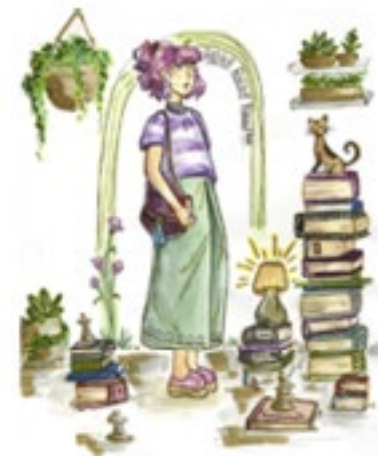
Annika Shearer Design

A Pierce County Library card is the ticket to a world of information and imagination through books, e-books, audiobooks, movies and other materials.