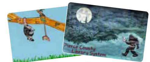
Library Card Contest 2020 Winners